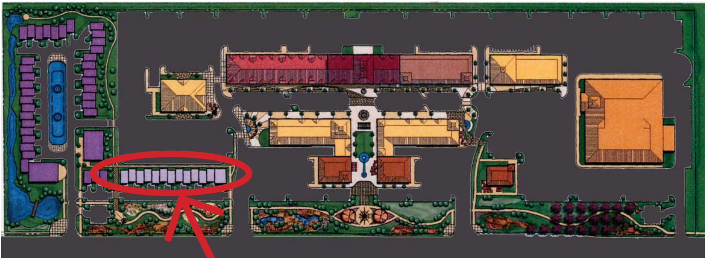
housing drawn in current site plan current site rezoning request map